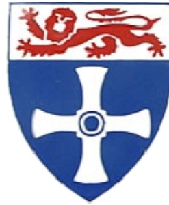
University of Newcastle upon Tyne